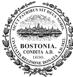
MARTIN J. WALSH MAYOR